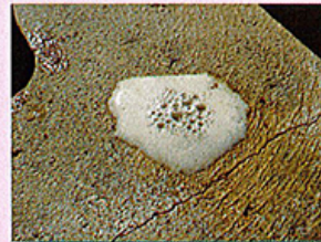
Foaming / bubbling - indicates calcium