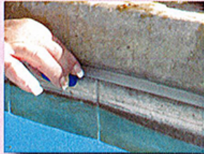
Spot test - calcium or not?