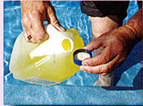
Cap test - use pool acid