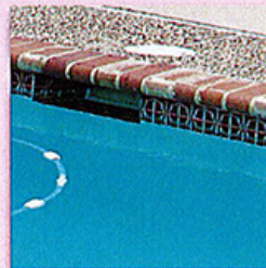
After cleanup, lower water level and use Beautec®