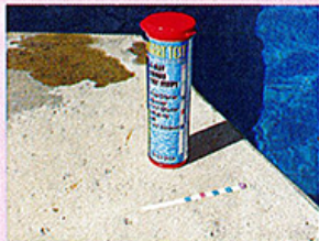
Keep chlorine levels at 3 ppm or less - do not shock