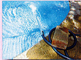
Raise and maintain water level above waterline scale